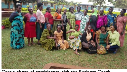
Group photo of participants with the Business Coach