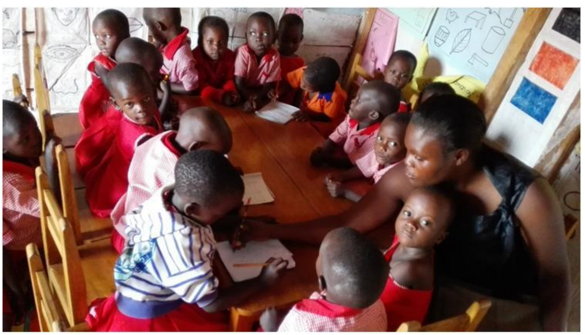
Baby class with their teacher