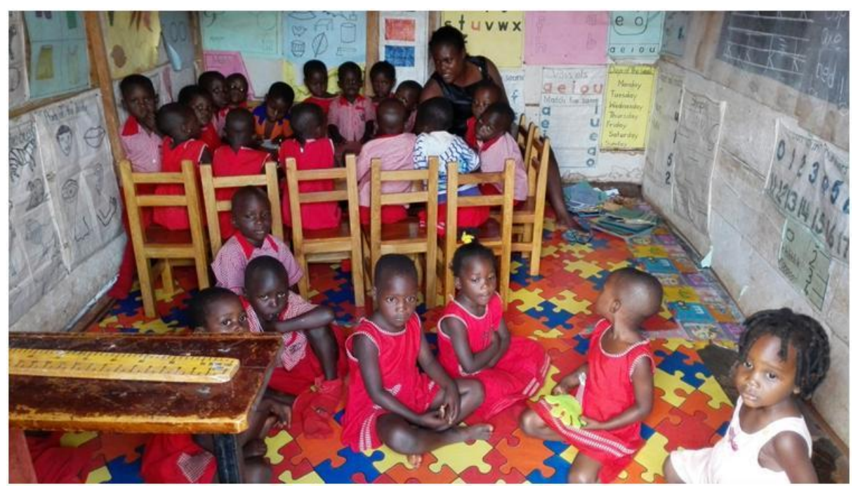
Baby class using the seats and table acquired as an in-kind WiB Loan

The WiB in-kind furniture loan has served to improve the schools' image. Betty hopes to increase the number of children enrolled in the near future.