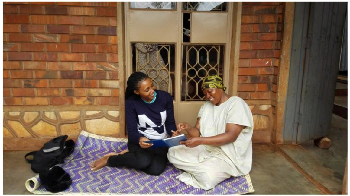
WCFJC APM coaching one of the WiB beneficiaries in record keeping

During the month of July, the WCFJC staff concentrated on record keeping coaching. The Assistant Project Manager (APM) helped mentor new participants who still struggle with record keeping. Through follow up visits, the APM discovered that, some beneficiaries do not follow through and implement the record keeping training provided at every WiB quarterly workshop. There is therefore a need for constant supervision and monitoring.